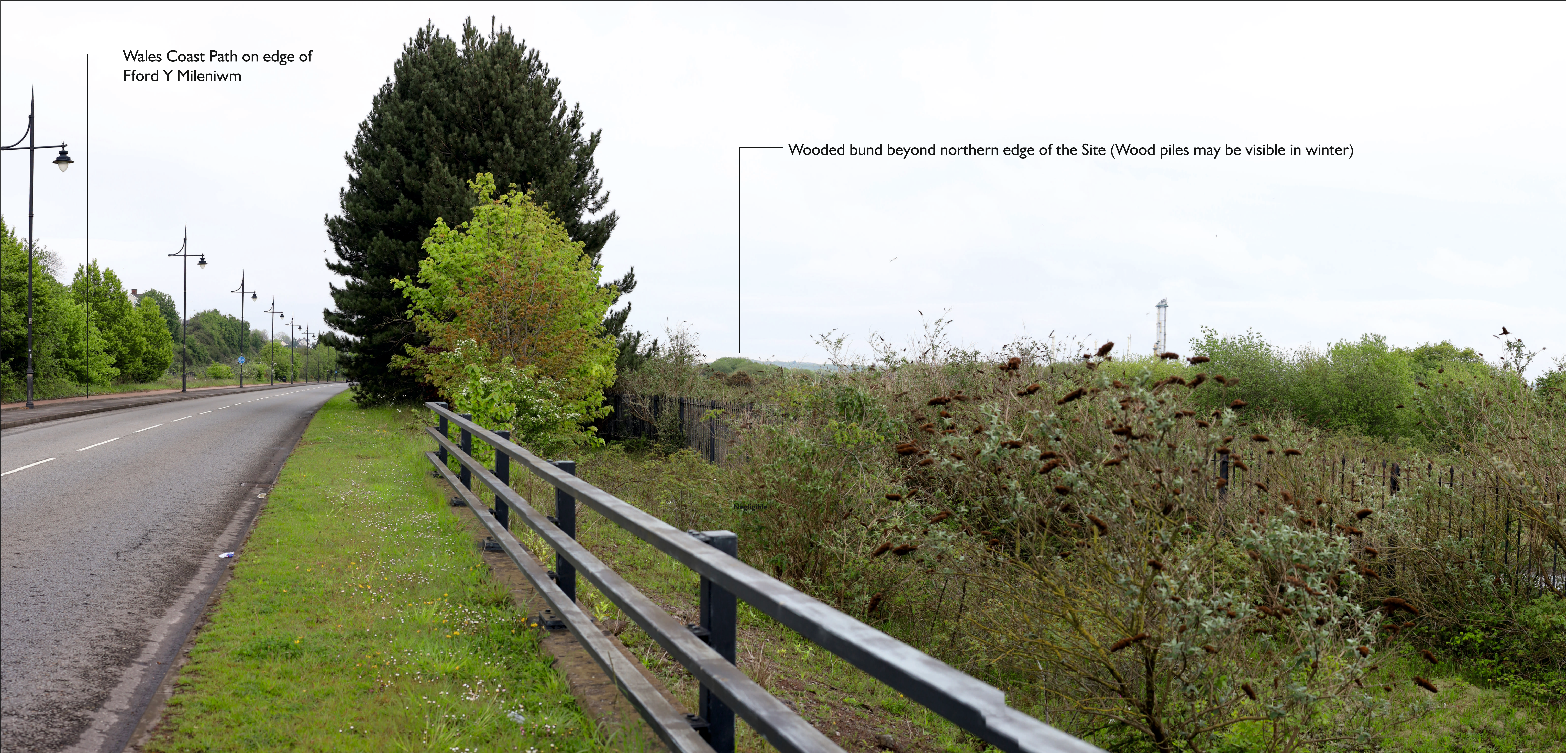
Representative Viewpoint 10 - Looking east from Ffordd Y Mileniwm by bridge over railway